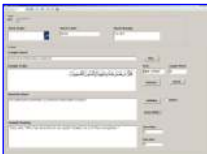
Figure 2. Lexical pattern extraction module.