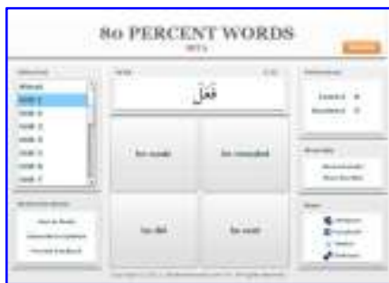
Figure 4. Prototype test interface.

A prototype test driven module was created using Adobe Flex as shown in Figure 4. The test module was divided into multiple quiz modules each containing 12 vocabulary questions. Before beginning the test, the user could review all the words for that module by accessing the list of words and their meanings for the chosen quiz module.