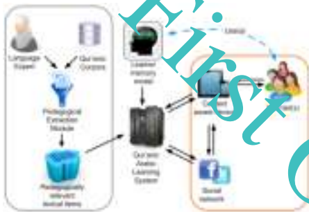
Figure 1. Model of Qur'anic Arabic learning system.

Figure 1 shows the interactions and relationships among various entities in our Qur'anic Arabic learning system. This system will have a default idiomatic and interlinear translation, transliteration and recitation sound file for the particular example. The expert will be able to change and edit some of this information. The examples will be shown to the user during learning sessions to bridge the breath-depth paradox of learning lists of lexical items. After the verification of the expert, these data will be preserved in the pedagogically relevant lexical item database with all the dependencies and examples from the Qur'an. Figure 2 shows a prototype of the lexical pattern extraction module built for the system.