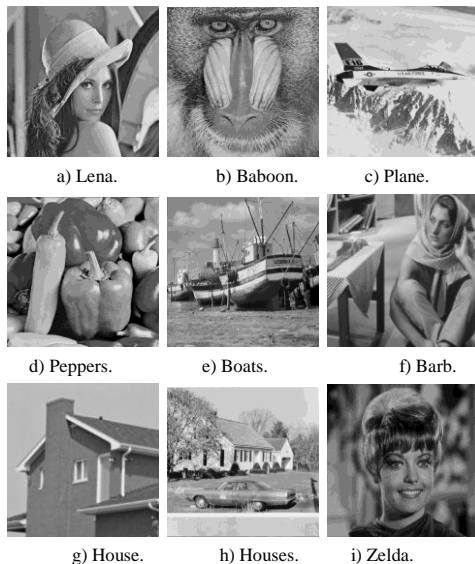
Figure 2. Cover images, each of size 512×512.

This section discusses the comparative analysis of our proposed scheme with other existing schemes [4, 13]. For exhaustive analysis, we have taken nine gray scale images, namely “Lena”, “Baboon”, “Plane”, “Peppers”, “Boats”, “Barb”, “House”, “Houses”, and “Zelda” each of size 512×512 pixels as shown in Figure 2. The scheme is implemented in MATLAB running on Intel (R) Core (TM) i5 processor 3.20-GHz with 4-GB RAM hardware platform. The secret data used in the experiment is a stream of random bits, generated by a Pseudo-Random Number Generator (PRNG). For comparison, three parameters, namely hiding capacity, Peak Signal to Noise Ratio (PSNR), and Mean Structural Similarity Index Measure (MSSIM) are used to evaluate the performance of existing schemes and the proposed scheme.