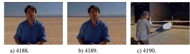
Figure 2. Showing abrupt transition.

The output of the hidden layer, y , is calculated using Equations (6) and (7) and it yields y=[0.000000,0.00003,-1.000000] . Using Equations 8 and 9, output of the output neuron, o , is obtained as 1.000000, which is the target value of abrupt transition as shown in Table 2.