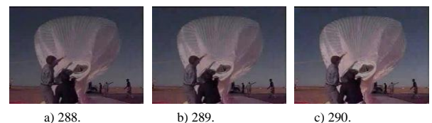
Figure 3. Showing fade-in transition.

The output of hidden layer, y , is calculated using Equations (6) and (7) and it yields y=[0.999999, 0.002919, -1.000000] . Using Equations (8) and (9), output of the output neuron, o , is obtained as 0.099797, which is the target value of fade transition as shown in Table 2.