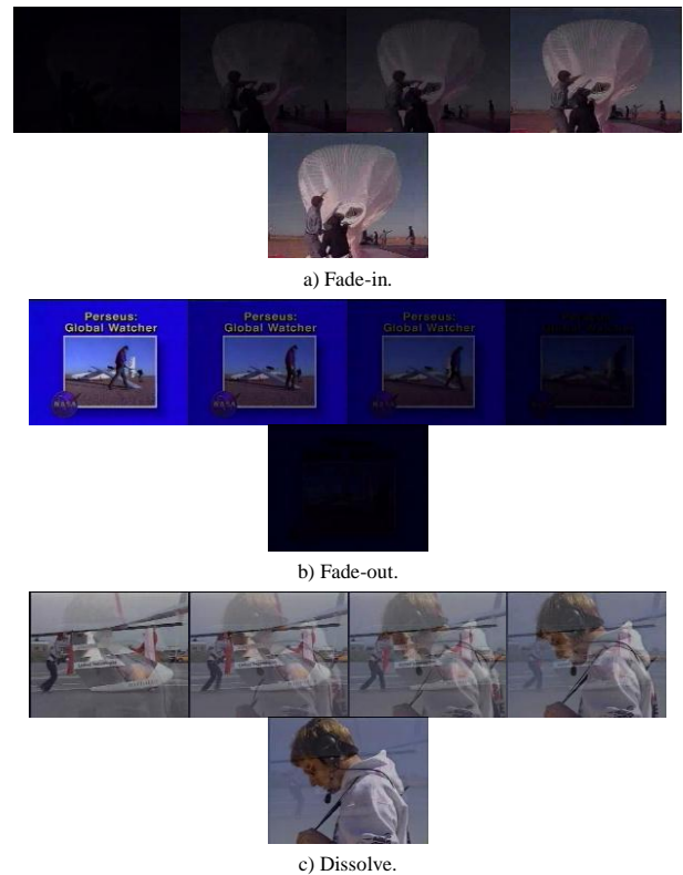
Figure 6. Showing shot transitions of the examples discussed in Figures 3, 4, and 5 respectively.