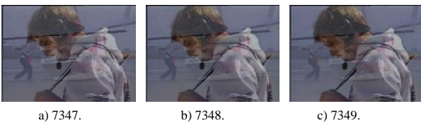
Figure 5. Showing dissolve transition.

4. Frames 7347, 7348 and 7349 as shown in Figure 5 and their corresponding colour histogram difference HD_{i-1}=0.099002 , HD_i=0.121386 and HD_{i+1}=0.105327 are considered for dissolve transition.